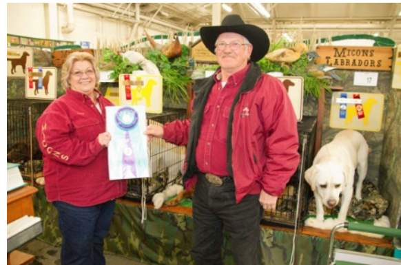
Labrador benching area. Congratulations to Micons for best decorations.