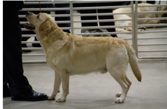
Sunday breed ring.